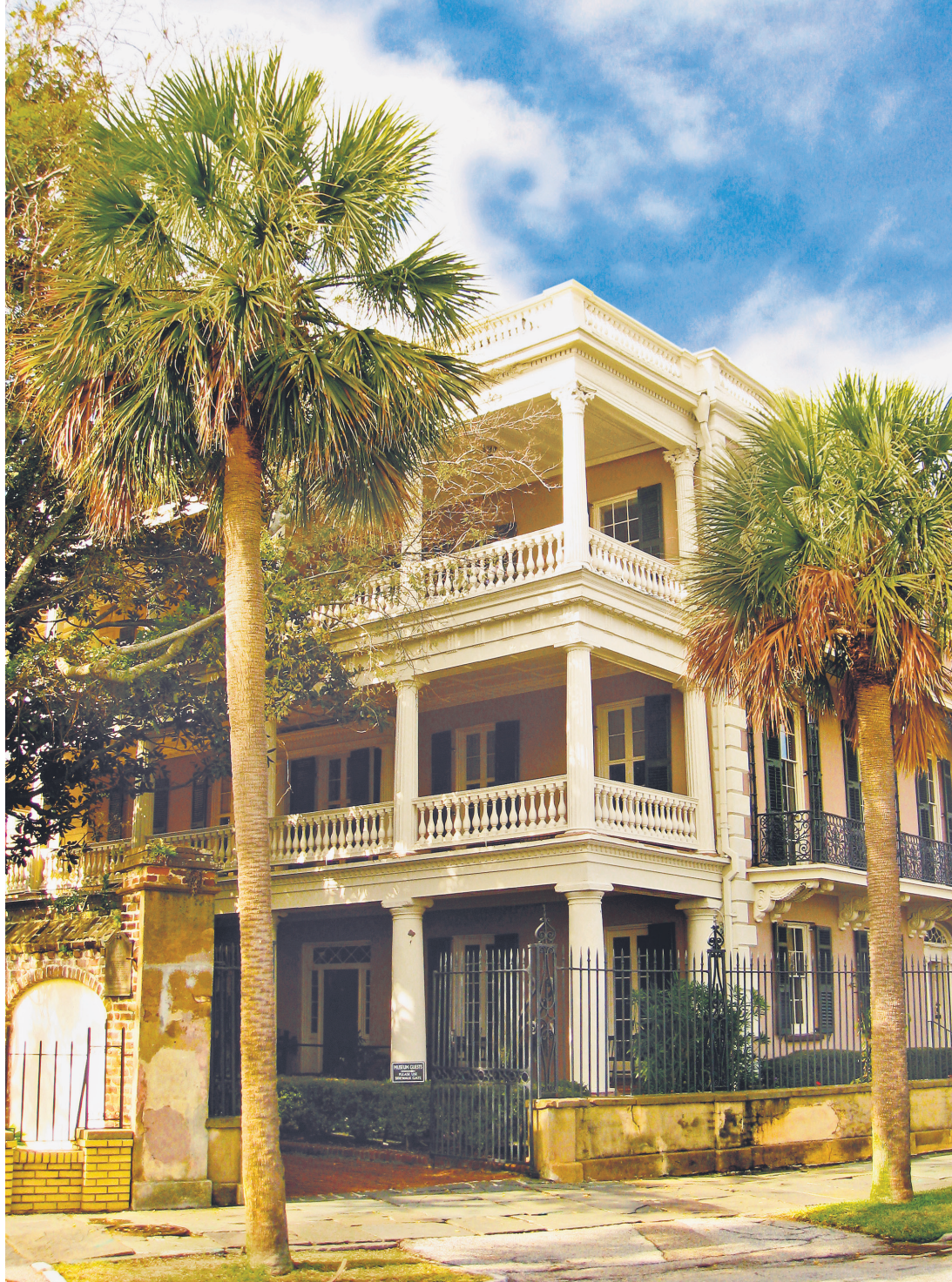
Charleston's Edmonston-Alston House features a unique blend of architectural styles.

W ith a little imagination, a trip to one of our nation's historic Southern cities can seem like taking a trip back in time. In places like Charleston, S.C., Savannah, Ga., and Williamsburg, Va., life just seems a bit slower. Maybe it's the heat that slows the pace, or perhaps it's the simple Southern charm that governs the attitudes and lifestyle here. Whatever the reason, a visit to one of these Southern destinations is sure to inspire you to slow down and drink in everything they have to offer. If you're looking to get away for a week or longer, we've rounded up some great destinations of historic significance.