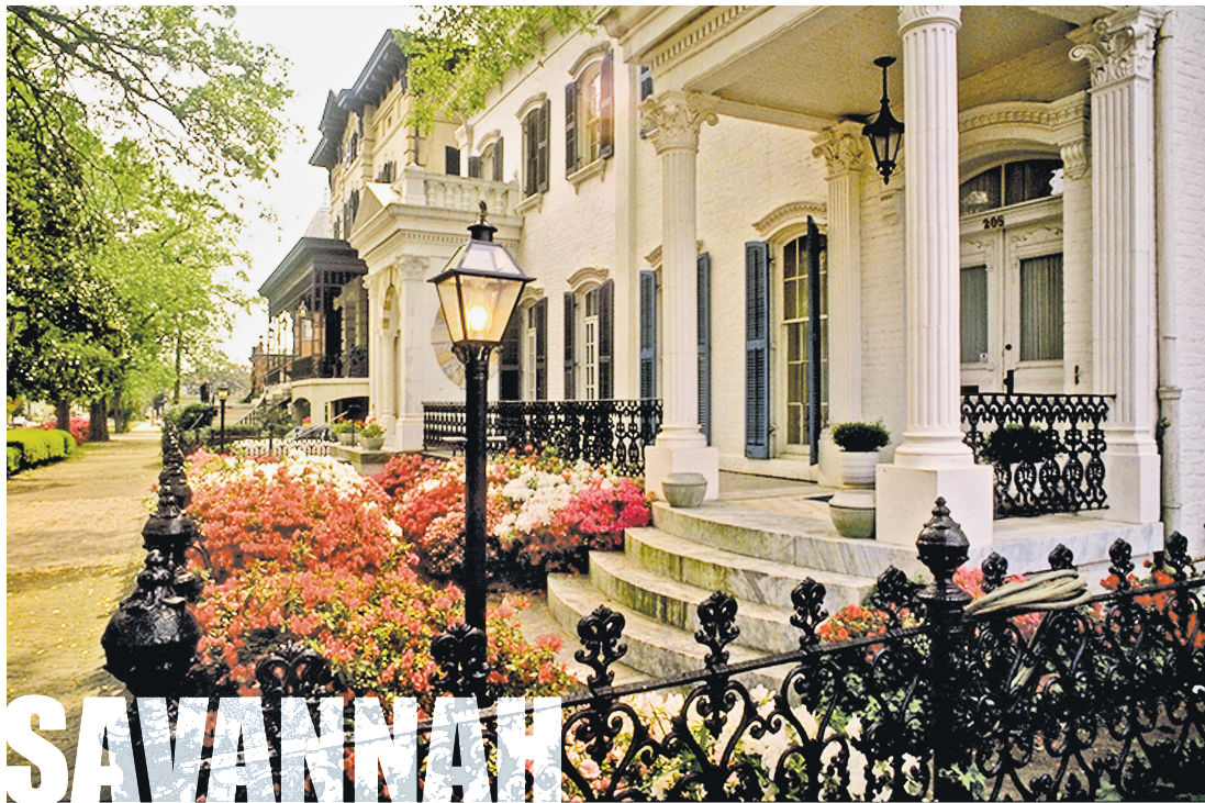
Savannah's Historic District is filled with historic homes, beautiful gardens and more.

When John Berendt's book Midnight in the Garden of Good and Evil hit store shelves in 1994, it was a boom for the city of Savannah. Loosely based on a real-life murder mystery, the intriguing literary work drew thousands of tourists to this sleepy Southern city. Today, visitors can still take in a walking tour based on the characters and places (including grave sites) found in the book.