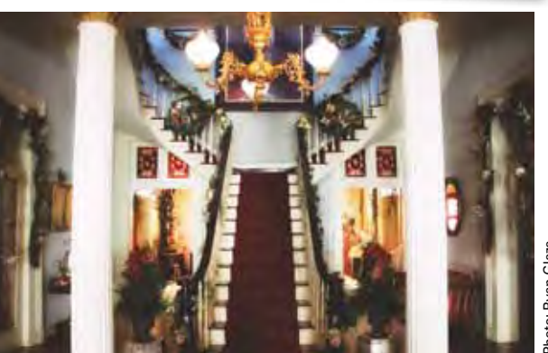
>> WAYS TO GET OUT, PAGE 4