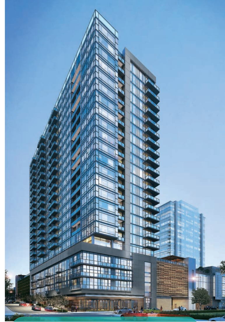
Twelve Twelve, a new condo community, is located at 12th and Laurel in The Gulch.

In addition to retail and restaurants, downtown Music City has a wealth of — surprise — music hotspots. Nashville has been getting national notice for it's music scene — and it's much more than country music that is thriving in Guitar Town; Music City's burgeoning pop scene recently led The Atlantic to dub Nashville the "Silicon Valley of the music business." The publication cited the city's transformation from "country music