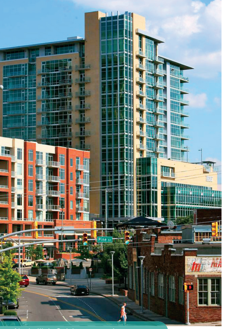
Nashville's Gulch area continues to grow with more condos, retail space and restaurants.